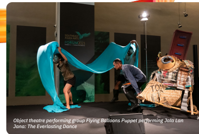
Object theatre performing group Flying Balloons Puppet performing Jala Lan Jana: The Everlasting Dance