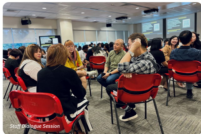
Staff Dialogue Session