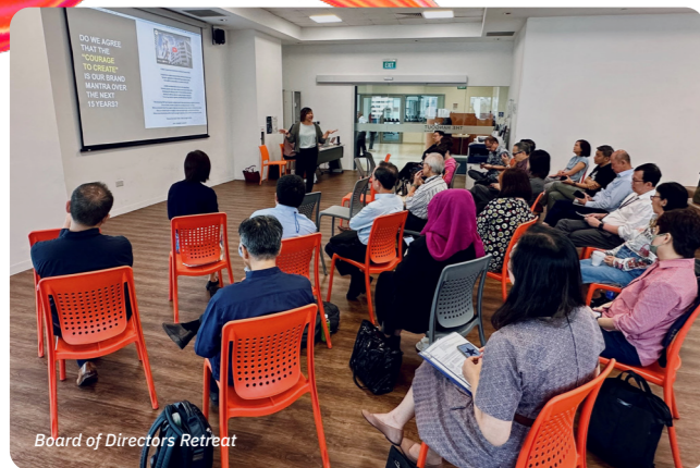
Board of Directors Retreat