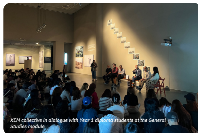
XEM collective in dialogue with Year 1 diploma students at the General Studies module