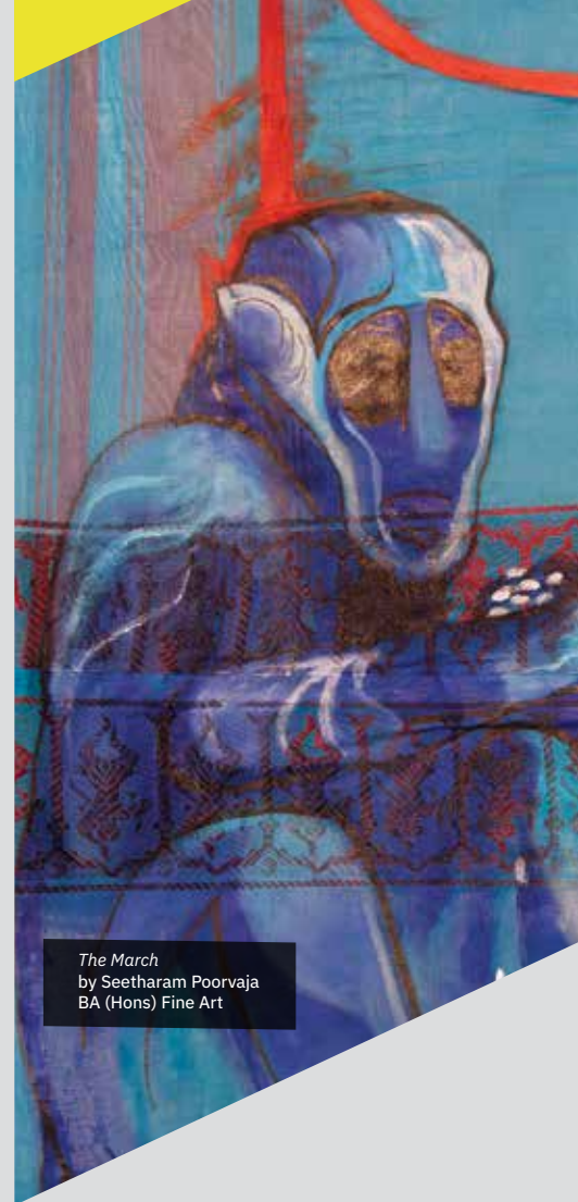
The March by Seetharam Poorvaja BA (Hons) Fine Art