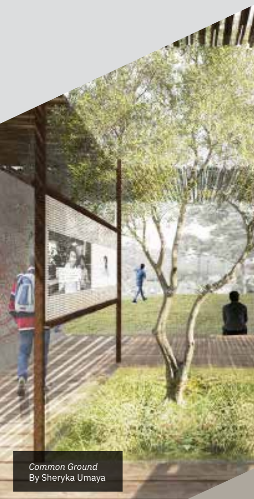
Common Ground By Sheryka Umay